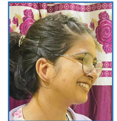
The power of WorldCF, made possible with your support!

The surgery must be done right the first time — the odds of success decrease with each attempt.